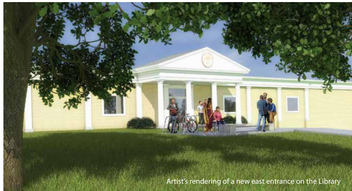
Artist's rendering of a new east entrance on the Library